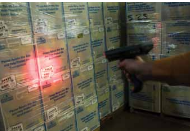
Scanning the barcode of an outbound pallet with a handheld computer equipped with a scanner and terminal emulator software.

Using these wireless handheld scanners in the warehouse has allowed real-time tracking of inventory, labor productivity and delivery status, while seamlessly interfacing with Mission’s SAP systems. In late 2009, they went live with the first location, adding two more locations in 2010. □