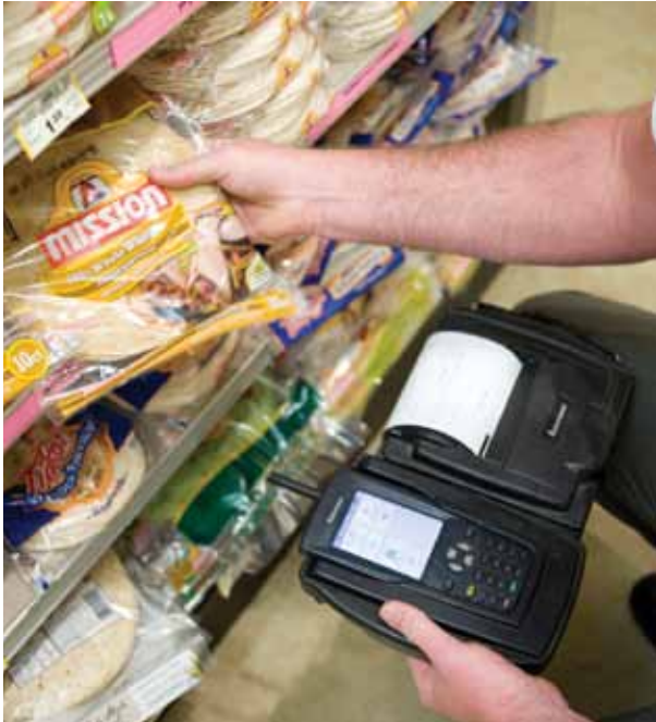
An independent distributor uses a handheld computer with attached portable printer to wirelessly transmit delivery information to Mission Foods in real time and generate invoices at a grocery retailer's store.

distributors are tasked with delivering the company's products to stores and producing invoices requiring a customer's signature before moving on to the next store.